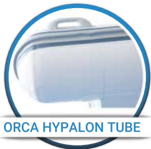
ORCA HYPALON TUBE

The tubes are made with 5-ply Chlorosulfonated Polyethylene (CSM) ORCA® HYPALON 828 manufactured by Pennel & Flipo™. This fabric is used by professional and military grade boats and is so superior we guarantee it with a ten (10) year warranty.